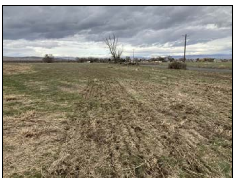
Seeded rows using no-till method