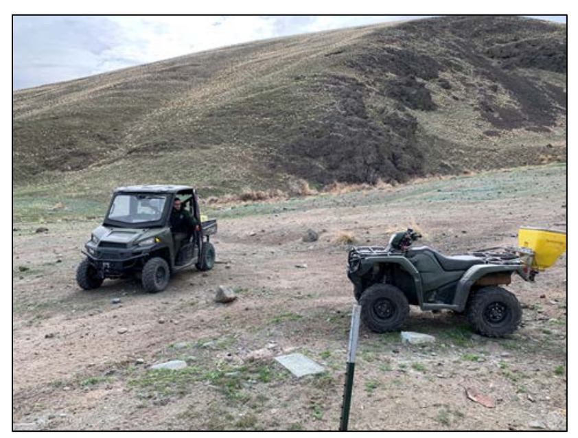
Hell's Kitchen three-acre restoration project