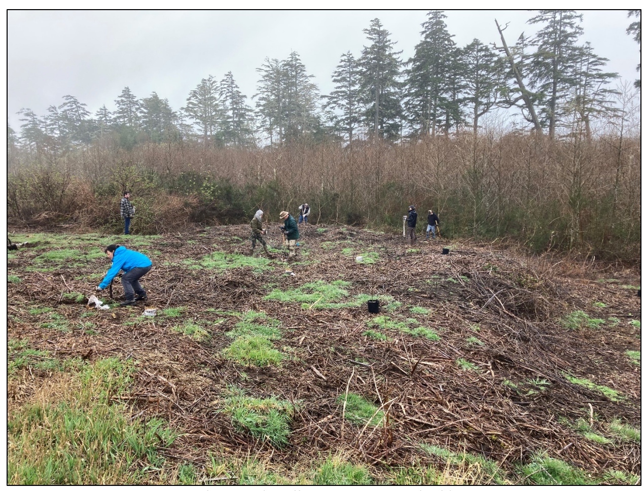
Planting the Elk River Unit - Bechtold