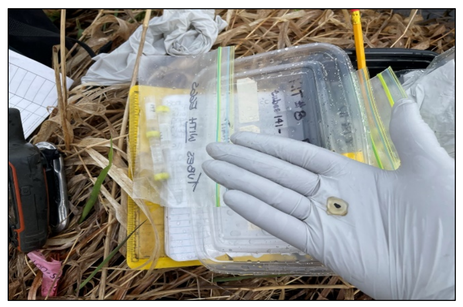
Biologists Tirhi and Butler completed collection of eggs for the 2022 spotted frog genetics study at all assigned locations with the exception of two on which the landowners would not allow access. One egg is collected per egg mass; the total number of eggs collected is dependent on the size of the population in that drainage

Oregon Spotted Frog Surveys: District 11 has concluded Oregon spotted frog surveys and egg collection for the genetics study. The season was twice as long as normal due to cold and warm snaps, weeks of no rain, and weeks of too much rain. This doubled the staff members' time needed to conduct surveys and collect eggs. Thankfully, all known locations that were active in 2021 had some level of activity again in 2022 with some sites having more egg masses and some having less. Tirhi and Butler conducted a last-minute rescue of eggs at the Salmon Creek oviposition site where an egg cluster was stranded in the middle of a dry field with no connection to deep water channels for out-migrating tadpoles. Tirhi and Butler dug a trench to enable connection.