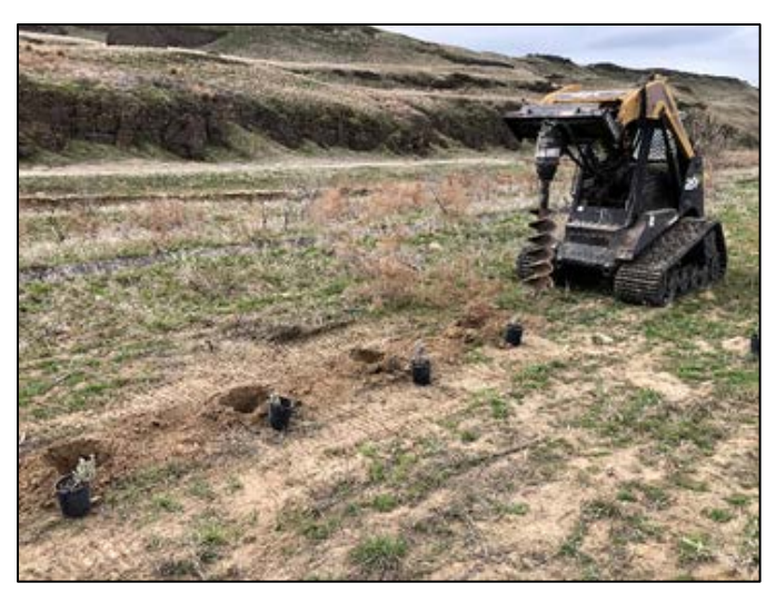
ASV with auger attachment used for shallow holes to plant sagebrush

Sagebrush Restoration: Sunnyside Snake River Wildlife Area Manager Kaelber and Assistant Manager Rodgers have been busy planting Sagebrush within the Esquatzel Unit. A fire in the fall of 2020 burned most of the sagebrush in the unit. Approximately 2,500 gallon-sized plants will be planted using a skid steer ASV with auger attachment.