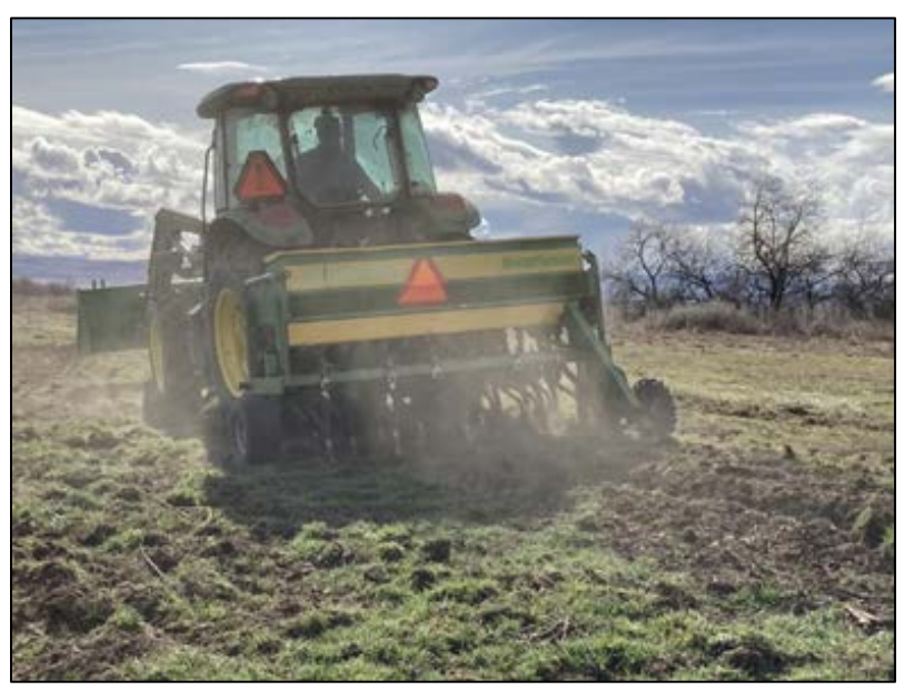
No-till seed drill

Sunnyside Native Grass and Forbes Seeding: Assistant Manager Ferguson and Natural Resource Technician Wascisin have been busy seeding mixes of native grass and forbs into areas that have been infested with kochia, teasle, poison hemlock, knapweeds and other invasives in recent years. Using a no-till seed drill borrowed from the Klickitat Conservation District, the two have seeded approximately 50 acres over the past couple of weeks. With recent spring rains, staff members hope to get the grasses growing and follow up with a broadleaf weed treatment when the invasives begin growing back.