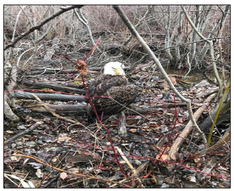
Eagle with signs of illness, but still head up and alert

Bald Eagle Sighting: While checking an elk fence crossing, Conflict Specialist Wetzel observed a bald eagle showing signs of illness or injury. The eagle was still active and will be checked again to determine if it needs to be brought to a rehabilitation facility.