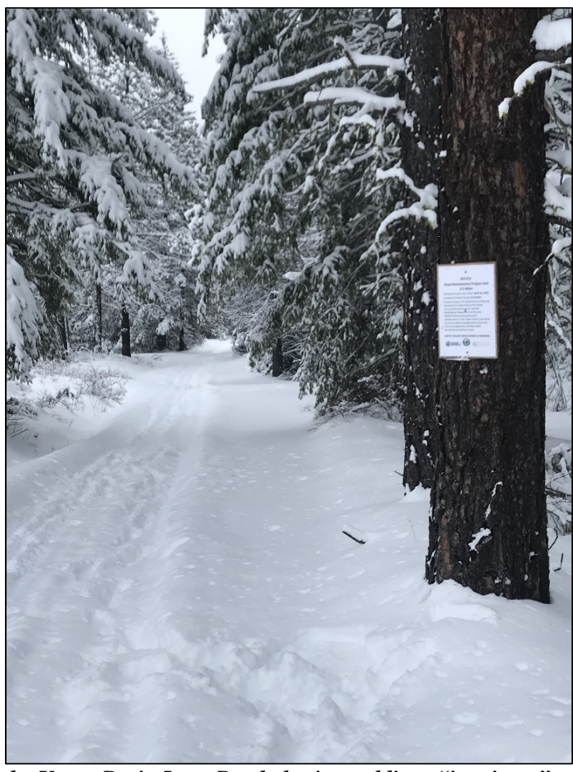
Signs posted on the Upper Basin Loop Road alerting public to "imminent" road improvement work, Colockum Wildlife Area

Colockum Wildlife Area Road Maintenance: WDFW has been coordinating with the Department of Natural Resources and the Chelan County Natural Resources Department on upcoming road improvement work. The Department Of Natural Resources is planning a timber harvest in the Stemilt Basin and will be upgrading roads across WDFW and Chelan County ownerships to be used as log hauling routes. The road work was scheduled to begin April 18, but the recent late snow has pushed that back. Assistant Manager Hagan did print and post signs alerting the public to the upcoming road work.