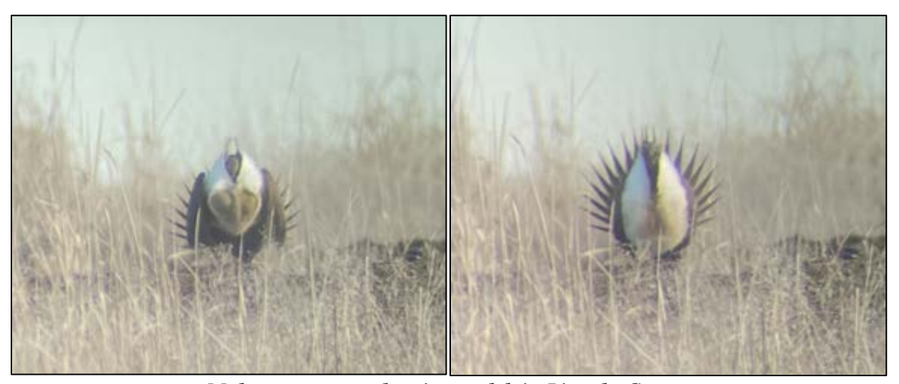
Male sage grouse dancing on lek in Lincoln County

Prairie Grouse Lek Surveys: Biologists Atamian and Lowe are conducting annual sage and sharp-tailed grouse lek surveys and searches. Currently there is still one active sage grouse lek in District 2, but only two males have been observed so far. Two sharp-tailed grouse leks have birds dancing already. Other leks are not showing much activity, but it is still early in the season for sharp-tails.