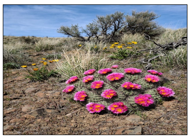
Hedgehog cactus flowering this spring on Brewton Ridge, Colockum Wildlife Area

Plant Viewing: Despite the recent cool weather, people are still accessing the lower elevations of the Colockum to view flowering native plants. Some are especially showy, such as the snowball or hedgehog cactus shown below.