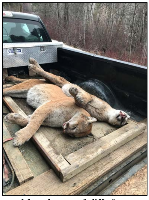
Two cougars recovered from bottom of cliff after natural mortality event