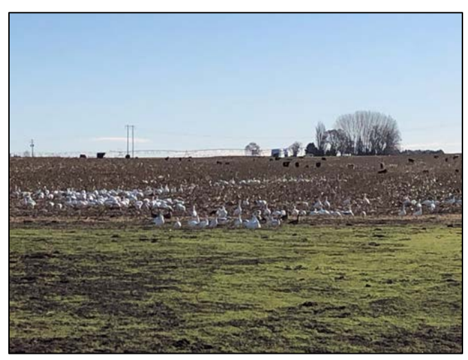
Snow geese and whitefront geese foraging near the Windmill Ranch headquarters

Waterfowl Viewing: Waterfowl are very easy to find within the Sunnyside, Windmill, and Mesa units of the Sunnyside Snake River Wildlife Area. Agriculture fields are being utilized by sandhill cranes, snow geese, and white-fronted geese. The wetlands of these units are a great place to observe various duck species like pintail, northern shovelers, widgeon, and mallards.