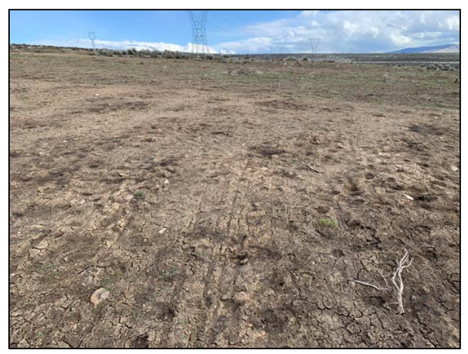
23-acre Vantage Highway Fire restoration

Vantage Highway Fire Restoration: L.T. Murray Wildlife Area Assistant Manager Winegeart evaluated the 23 acres that burned during the Vantage Highway Fire in 2021. The burn area will be chemically treated with a low glyphosate application to kill emerging cheatgrass and set back the bulbous bluegrass to give the native grass seed from the fall 2021 seeding a fighting chance this growing season.