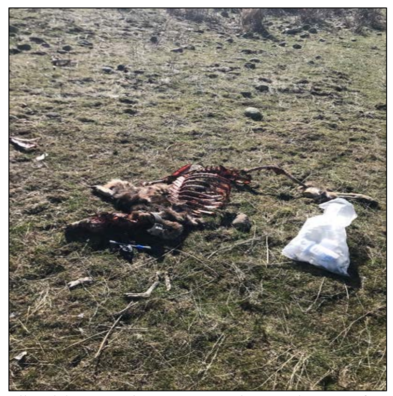
Another collared deer mortality, again very close to a location of one last year

Bald Eagle Sighting: While checking an elk fence crossing, Conflict Specialist Wetzel observed a bald eagle showing signs of illness or injury. The eagle was still active and will be checked again to determine if it needs to be brought to a rehabilitation facility.