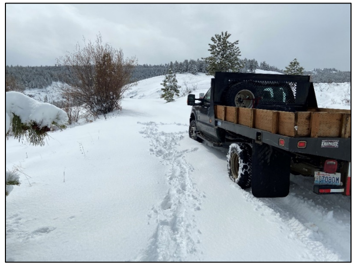
Access road to a Colockum Creek Prescribed Fire Unit

Colockum Creek Prescribed Fire Project: The WDFW Prescribed Burn Program Crew members were scheduled to arrive on the Colockum Wildlife Area the week of April 11, but a late season snowstorm changed the plans. Crews were planning on freshening up fire breaks and start laying water lines in preparation for this spring burn treatment. Twelve inches of wet snow will delay this project.