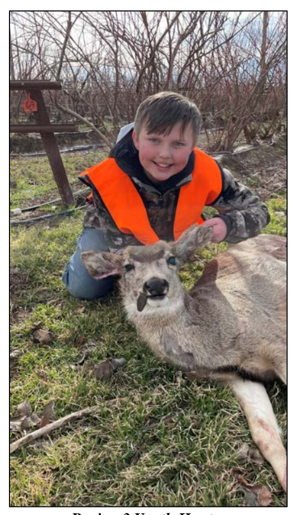
Region 3 Youth Hunter

Pasco Deer: District 4 Wildlife Conflict Specialist Hand continued to coordinate youth hunters for a large tree fruit operation near the Snake River who is experiencing tree damage to a newly planted block of cherry trees. One youth hunter off the Region 3 Youth Permit was able to harvest a deer.