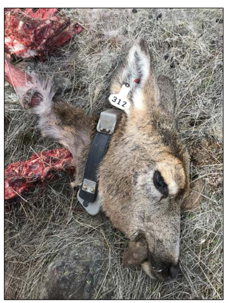
Predation event very close to the same type of mortality location last year

Conflict Specialist Wetzel recovered several radio collared deer mortalities. Most were cougar predation events in the same locations where other collared deer had died in previous years.