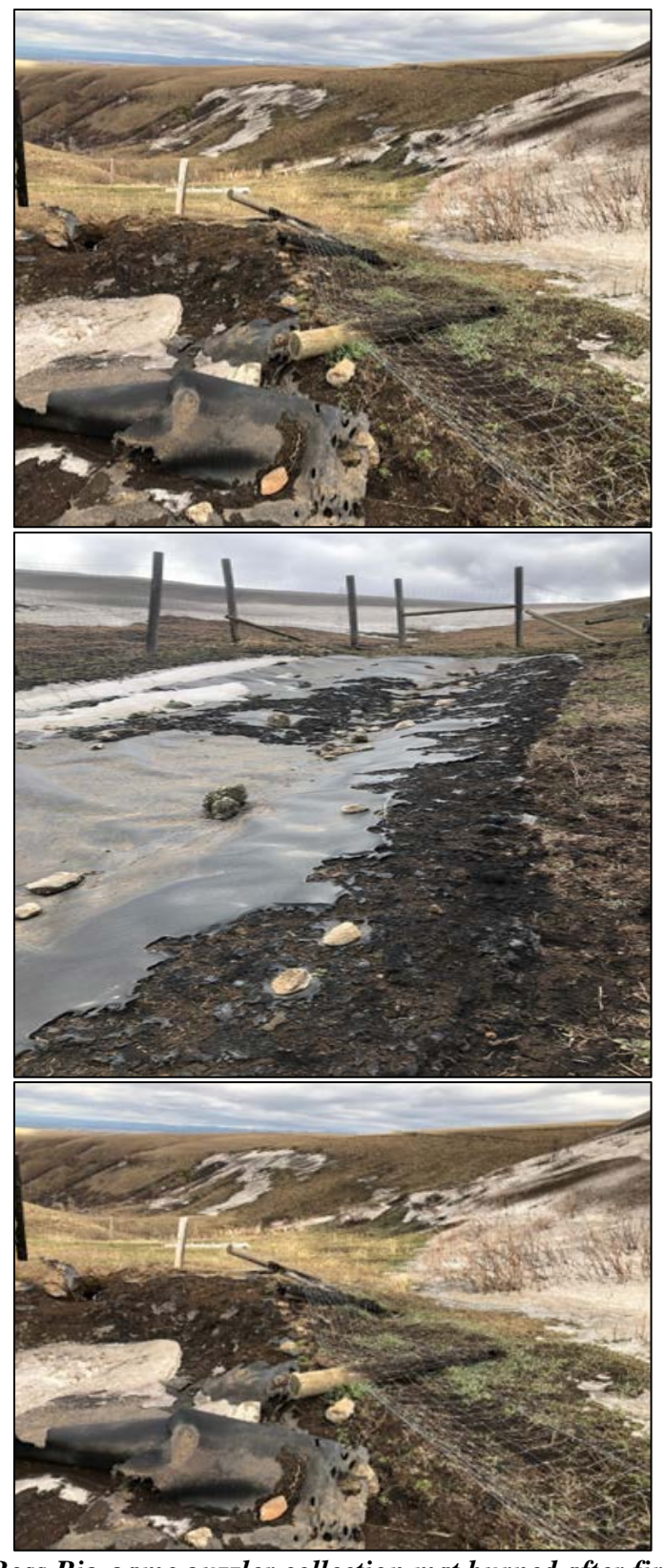
Boss Big-game guzzler collection mat burned after fire